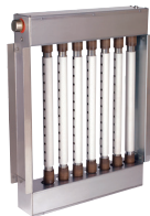
Ultra-sorb LV panel