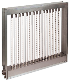
Ultra-sorb® XV panel