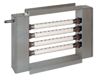
Ultra-sorb LH panel