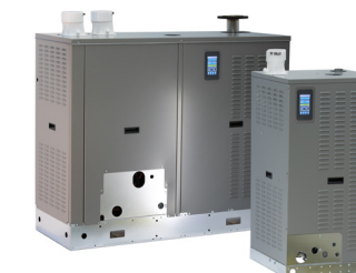
GTS HUMIDIFIER LX SERIES