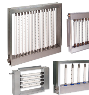
STEAM DISPERSION OPTIONS