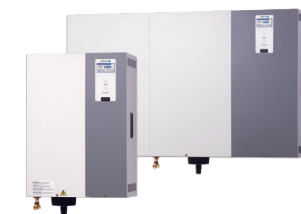
XT SERIES ELECTRODE HUMIDIFIER