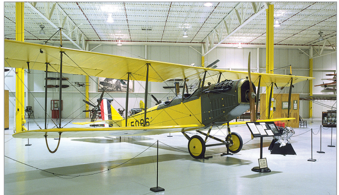
The Glenn H. Curtiss Museum in Hammondsport, New York utilizes a DriSteem GTS® gas humidifier to preserve historical artifacts and reduce energy costs.

The Curtiss museum is filled with hundreds of objects containing a variety of materials (wood, canvas, fabric and paint) that are subject to cracking, chipping, peeling and distortion without proper humidity levels – ideally 40% to 60% relative humidity (RH). When the Curtiss Museum opened, a humidification system was not installed, and the RH level hovered between 3% and 10%. Jim White, the museum's engineer, knew that he needed to maintain humidification at an RH level of at least 40% with minimal fluctuation ( \pm 3\% ) – or jeopardize the preservation of the museum's contents.