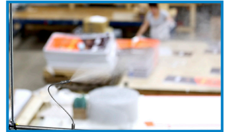
One of the 165 atomizing nozzles in over a quarter mile of tubing throughout Modernistic's 160,000-square-foot facility.